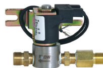
1099-42 Solenoid Valve