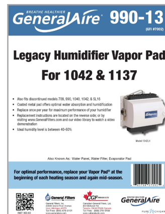
990-13 Vapor Pad® (GFI #7002)